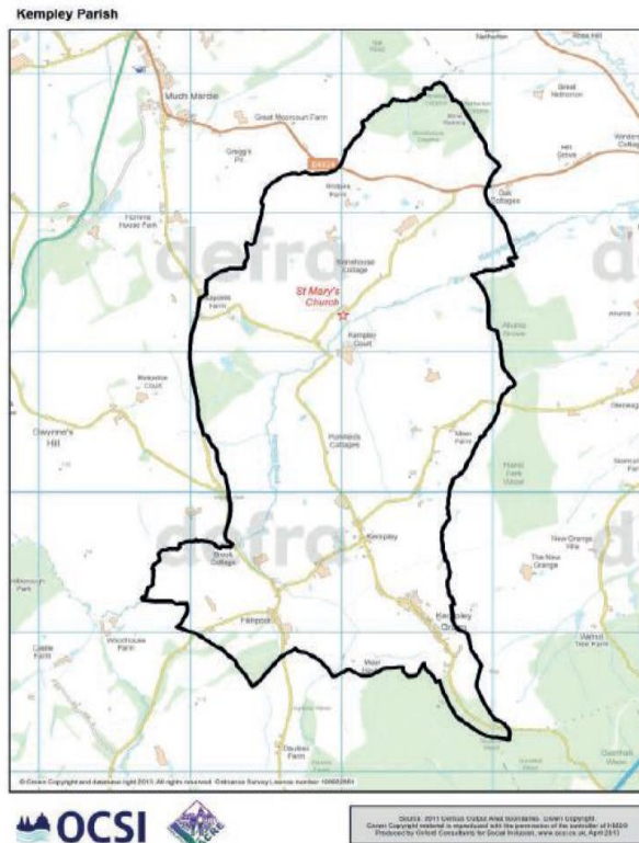
Designated Settlement Boundary

© Crown Copyright and database rights 2015. Ordnance Survey Licence number 100019102